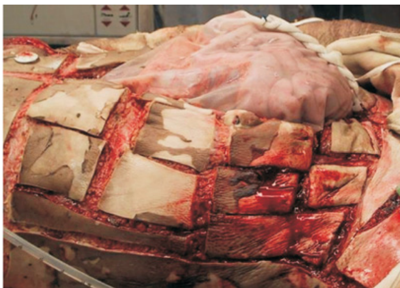
FIGURE 3. Burn patient who developed ACS and treated with midline laparotomy and covered with silo.