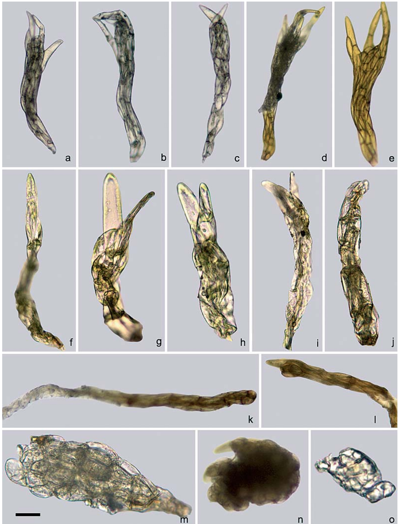
Fig. 2. Pohlia annotina (MA 7549): a-e , bulbils. P. proligera (MUB 1584): f-i , bulbils. P. flexuosa (MUB 21471): j-l , vermicular bulbils; m, n , sinuous outline bulbils; o , bulbils angular outline with papillae. Scale: a-e = 35 \mu m; f-i = 35 \mu m; j = 25 \mu m; k, l, n, o = 30 \mu m; j = 20 \mu m; m = 12 \mu m.