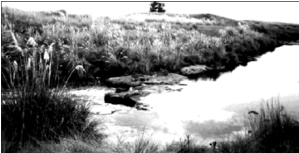
FIGURE 3. Predominant vegetation along the Claromecó creek.

Hydrophilic vegetation, such as Cortaderia and Creole Willows is usually found along the banks of the creeks. Tupaia , Hyalis Argentea , Terebinth Shrub , Sporobolus Rigens and Jonquil predominate in sandy soils.